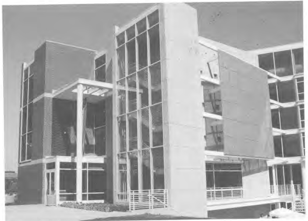
Temple Buell Hall as seen from the southwest