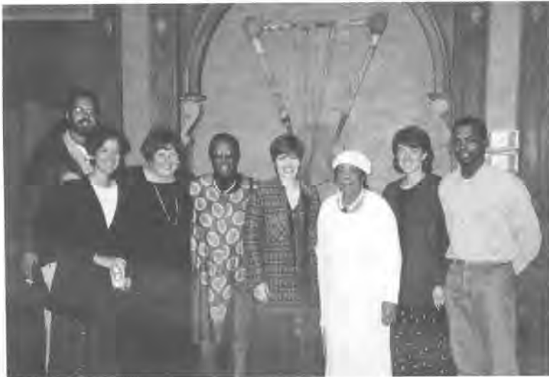
Urban Planning students worked with neighborhood residents to plan an open house at the Dunham Dynamic Museum in East St. Louis, IL

The ESLARP web site ( http://imlab9.landarch.uiuc.edu/~eslarp/ ) was upgraded and expanded to allow greater availability of project-generated research and training materials as well as internal and external discussion forums.