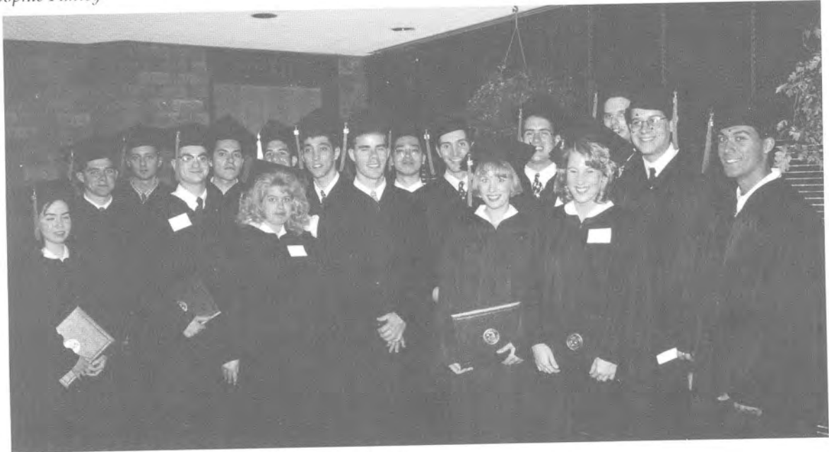
1995 Bachelor of Arts in Urban Planning graduates