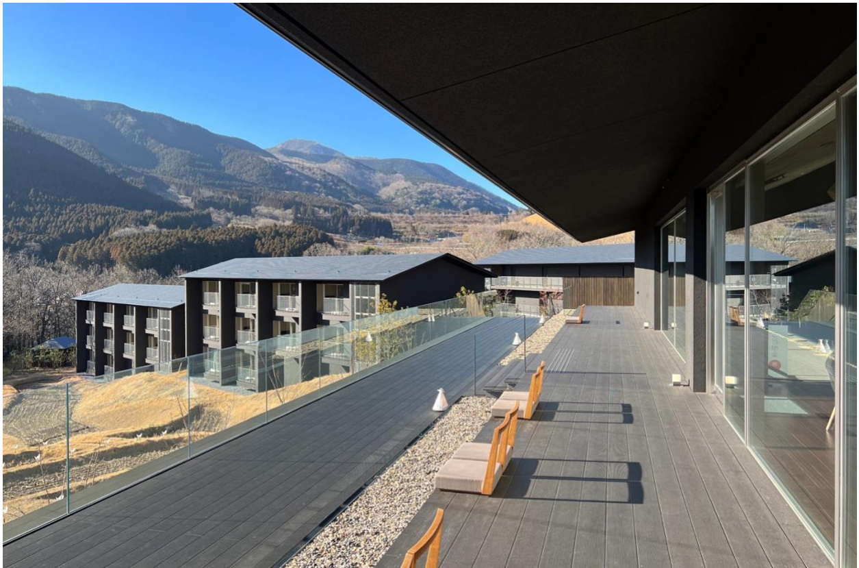
Kengo Kuma – Hotel KAI, Yufuin, Oita Prefecture, 2022 (photo by B. Bognar)