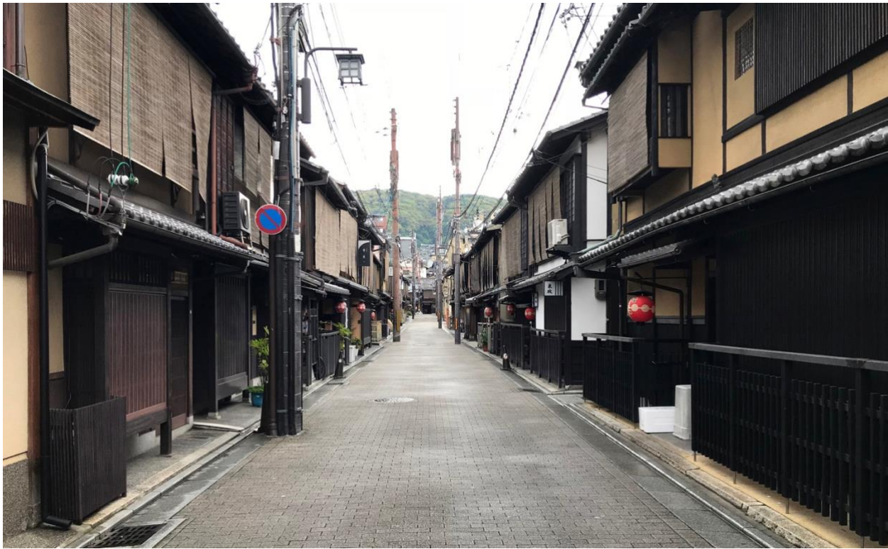
Kyoto's Gion-Shirakawa district with traditional urban residences ( machiya )