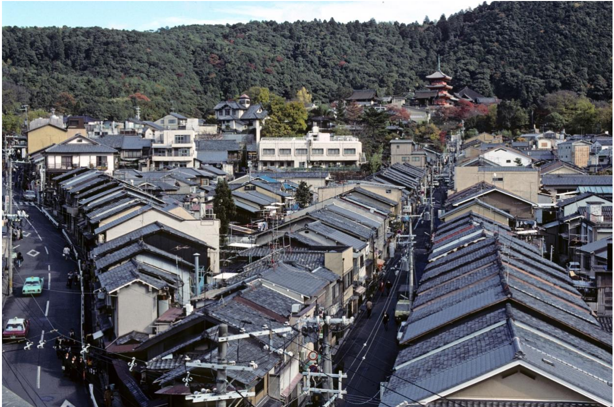
Kyoto's Kiyomizu-zaka district with the Kiyomizu-dera temple in the background

Kyoto, Japan's previous capital for over a thousand years (794-1868), is the cradle of Japanese culture and an exceptionally rich repository of architectural and artistic masterpieces, Shinto Shrines, Buddhist Temples, historic residential buildings, and countless exceptional gardens. It is also the site of many contemporary architectural examples including the works of Tadao Ando, Kengo Kuma, Arata Isozaki, Nikken Sekkei Ltd., Shin Takamatsu, and several others. While there are various types of hotel complexes in Kyoto, there is still a need for high-end, multi-service hotel complexes which work also as wellness centers or spas. Such hotels typically include various recreational, therapeutical, and cultural facilities with green architecture and gardens, all in tranquil setting.