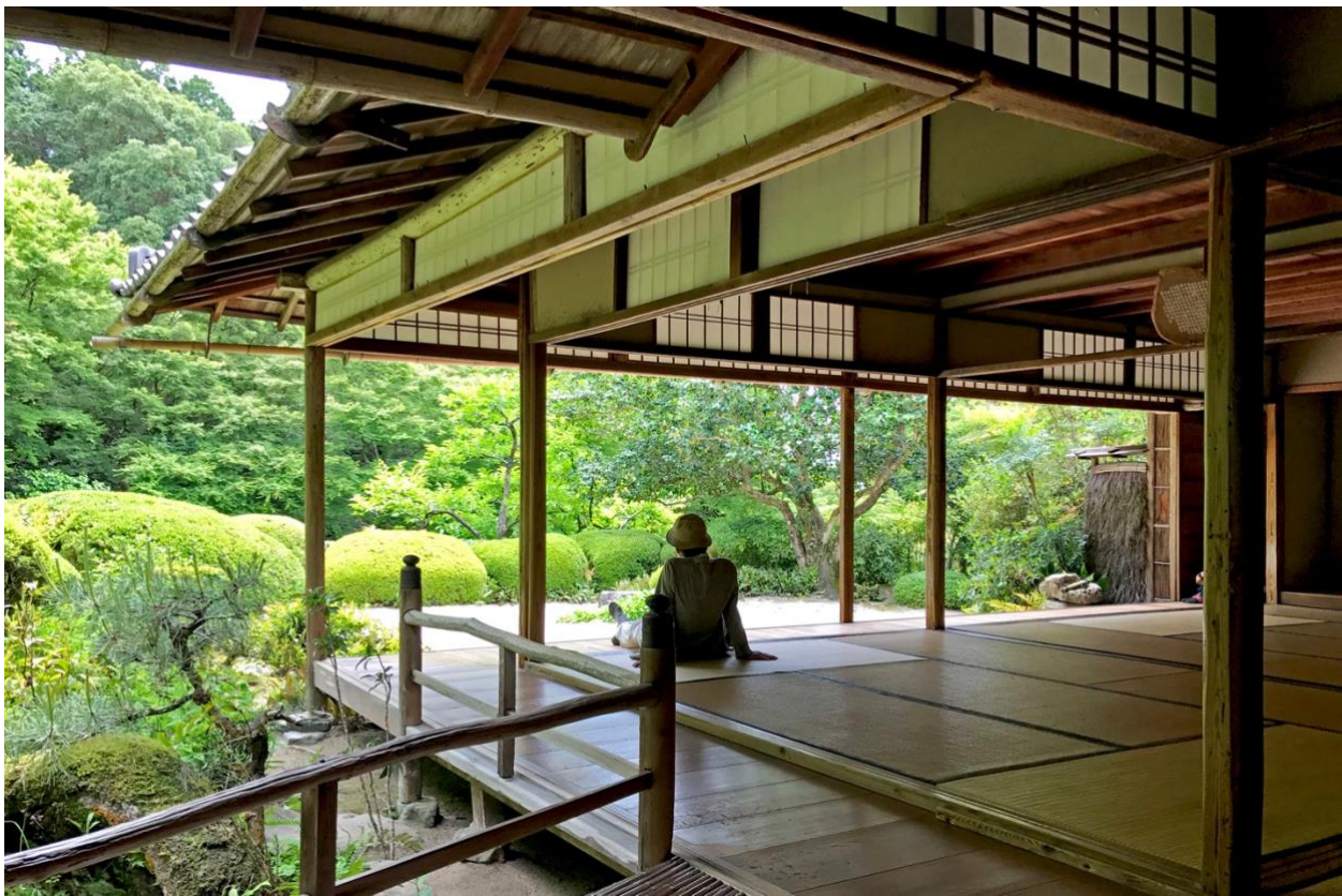
Shisendo, the residence of Ishikawa Jōzan, a 17 th Century poet in Kyoto, 1636