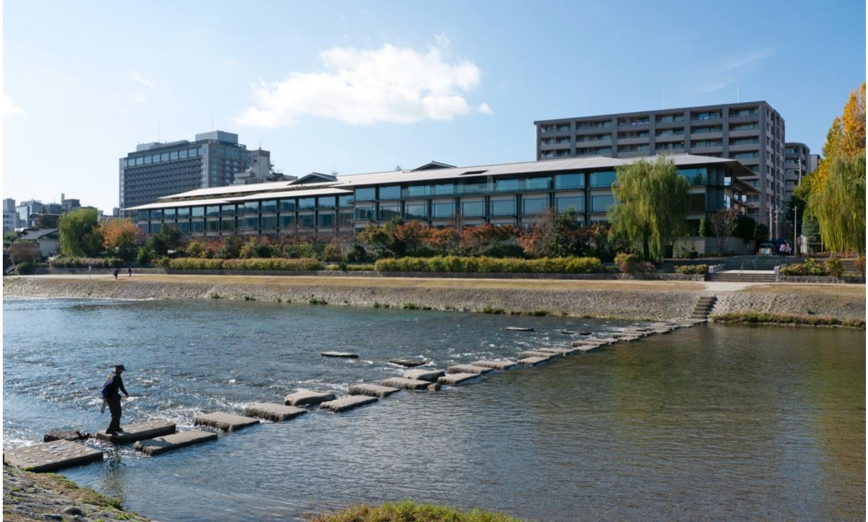
Nikken Sekkei Ltd. – Ritz Carleton Hotel, Kyoto, 2013