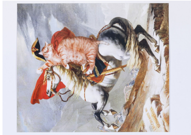
Fig 7 - Artwork on white foam board

To adjust the depth of the mount, unlock the two locks in the back then rotate the cranks while gently pushing or pulling the mount in or out.