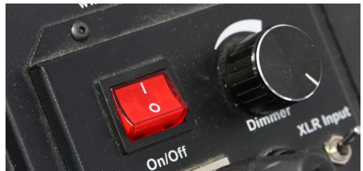
Fig 2 - Power Switch

1 Turn on both of the LED light panels on the Copy Stand by using the red power switches on the back. Make sure that the dimmer dials are turned up to full power. Turn off all other light sources in the room.