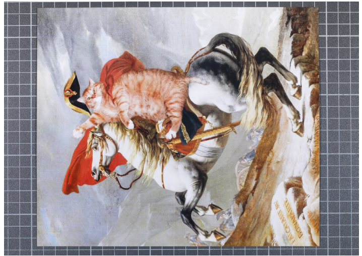
Fig 4 - Properly centered artwork filling the frame

You may also want to consider backing material to give the piece a nicer looking backdrop than the gray gridded board. Black or white foam board, or various colored clothes or boards often make good backgrounds.