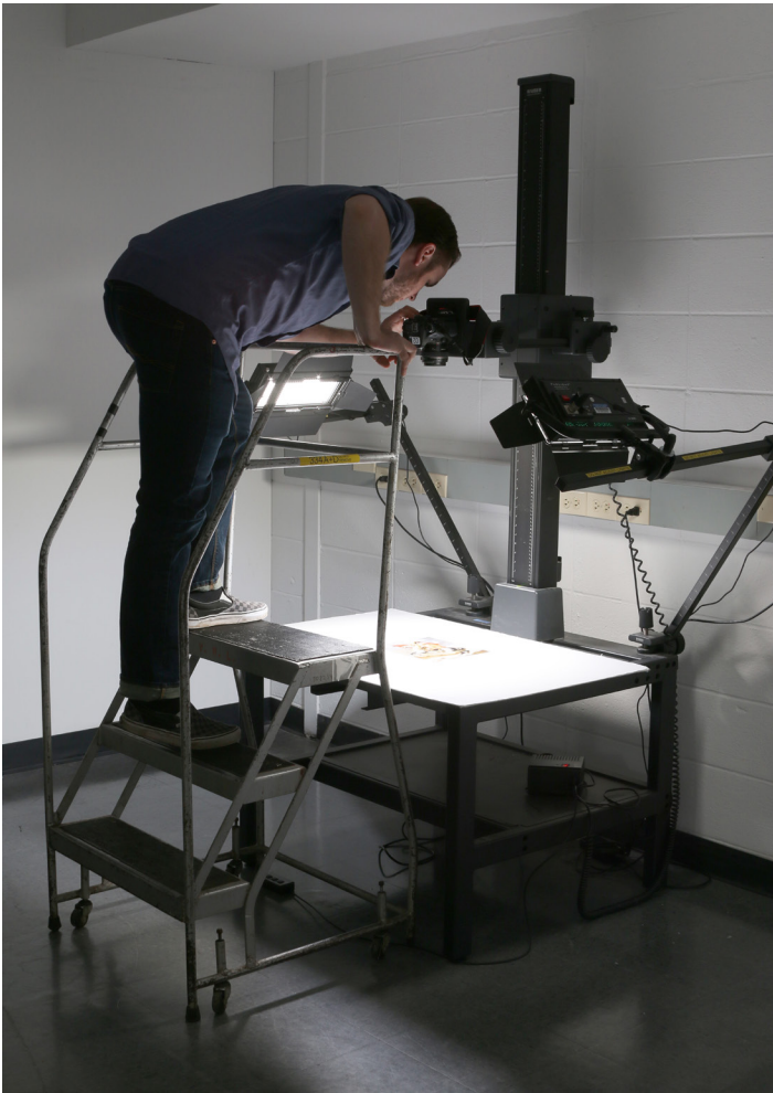
Fig 9 - Use step stool if needed

5 If the camera is too high for you to reach or operate, DO NOT STAND ON THE TABLE. Use the step stool provided in the studio.