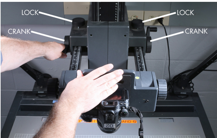
Fig 6 - Depth adjustment

4 Do not use any adhesives (tape, glue, spray, etc) on the Copy Stand table. If a piece needs to be secured to the table, place a sheet of butcher paper, cardboard, foam board, or some other backing material underneath it and secure the piece to the backing.