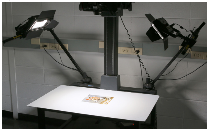
Fig 8 - Artwork on white foam board