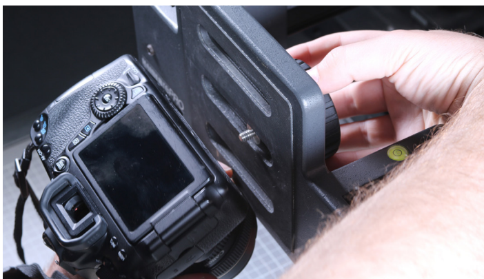
Fig 3 - Camera Mounting

2 Carefully mount your camera on the Copy Stand. The Stand uses a standard tripod mount. Hold your camera steady and rotate the screw from behind. Do NOT rotate your camera while screwing it in. Do NOT let go of your camera until you are sure it is securely mounted. Make sure that your camera is pointing straight down, perpendicular to the surface of the table.