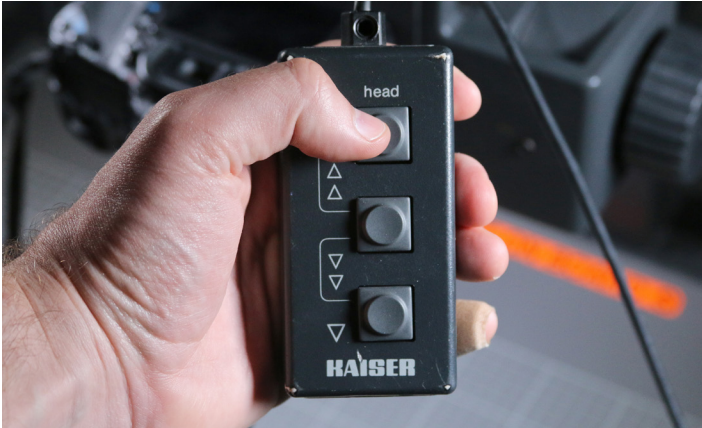
Fig 5 - Height adjustment

3 Adjust the camera mount and your artwork to get the piece centered in the view of the camera. You want the artwork to fill as much of the view as possible.