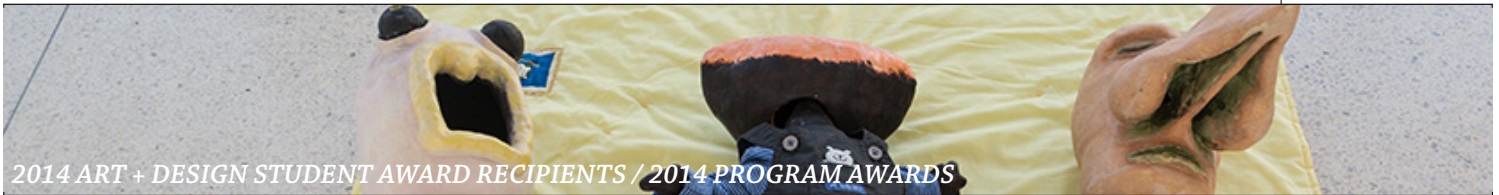
2014 ART + DESIGN STUDENT AWARD RECIPIENTS / 2014 PROGRAM AWARDS